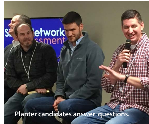
Planter candidates answer questions.

We also praise God for the heartbeat of the assessment team, comprised of pastors, seminary professors, ministry leaders, all servant-hearted volunteers. The team members love and care for the planting couples in a very special way throughout the two days. Every team member