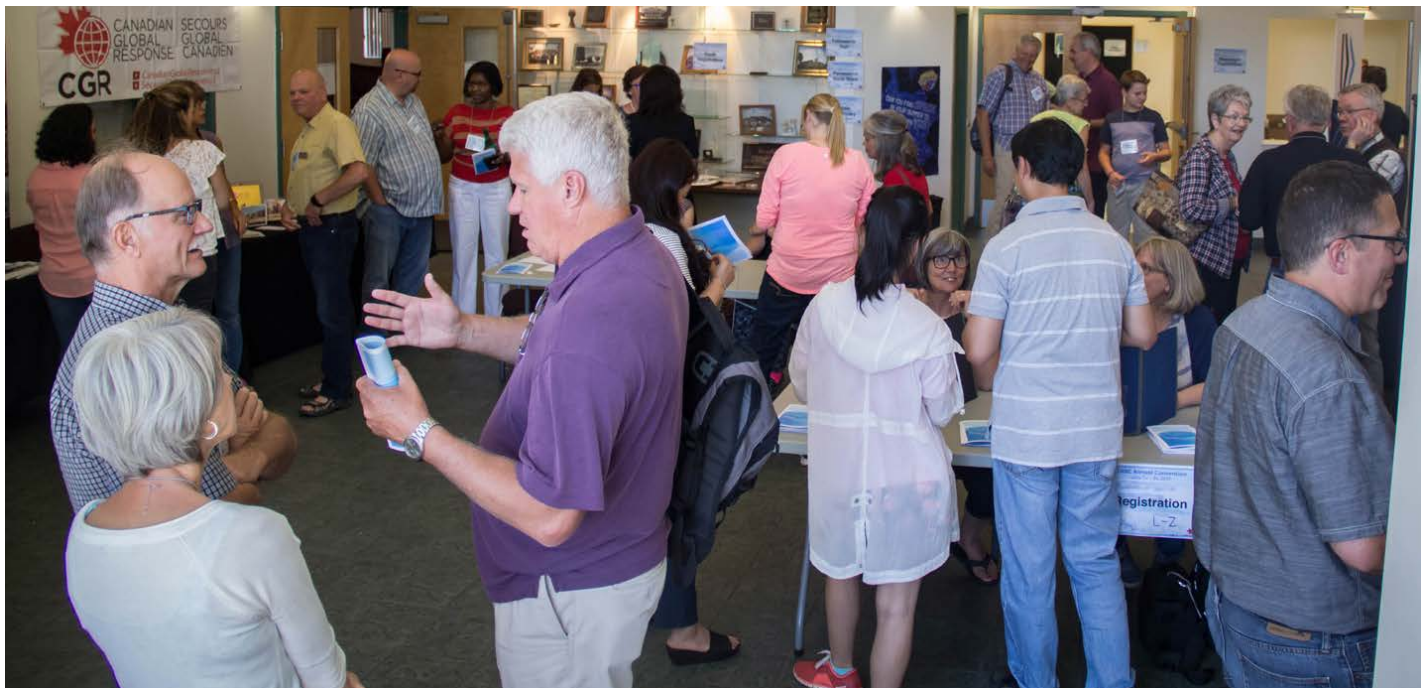
Fellowship time at the Convention is a great time to renew old acquaintances and make new friends.

"The new churches focus more on evangelism because they don't have anybody there. The older churches focus more on maturing existing believers because that's who they have. And it's only if they do a good job of that that they end up with reproduction," he says. "So yes, the new churches produce more converts. But we value all the churches because they're the ones that become the partner churches, they're the ones that have the potential to multiply converts into disciples."