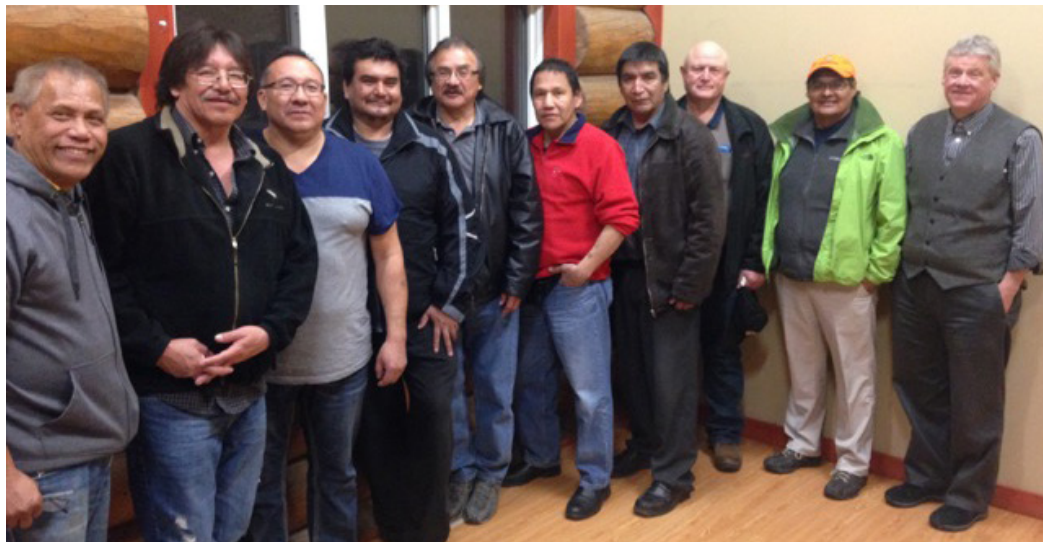
First Nations leaders meet for leadership training, jointly sponsored by CNBC Cooperative Program funds and Gospel for Samaria, based in Lloydminster, AB.

Many First Nations leaders who are indigenous to a particular reserve are also frustrated by summer tent meetings. Charismatic groups put on a weeklong meeting, preach their brand of religion, take offerings and leave no one behind to disciple those who said yes to Christ. It is frustrating as it creates confusion about