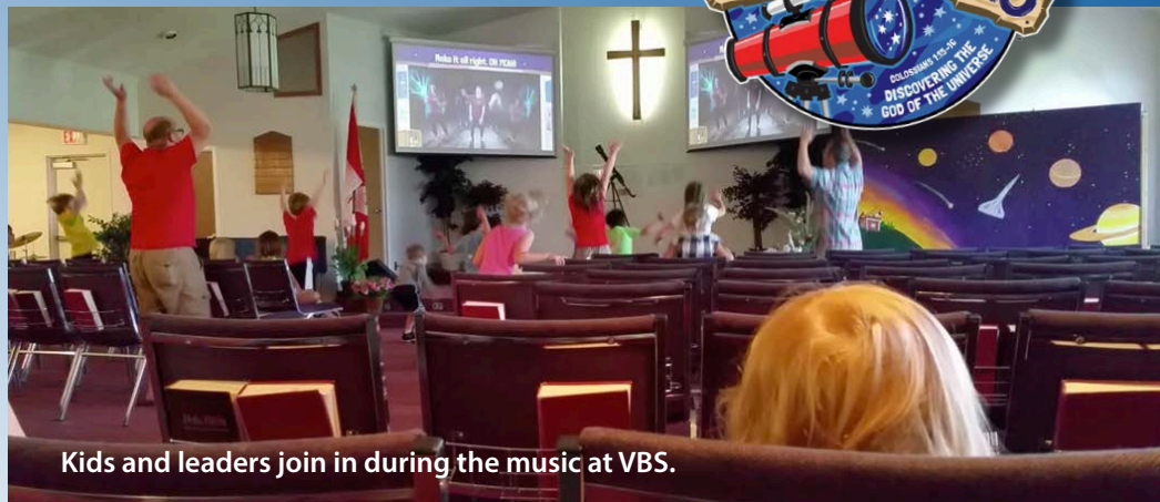
Kids and leaders join in during the music at VBS.

To our delight, three more children gave their hearts to the Lord on Friday.