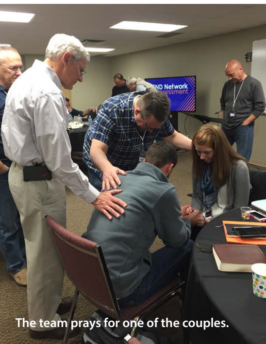
The team prays for one of the couples.

The assessment retreat is designed to partner with each planting couple in their specific call and help them determine their preparedness to plant. There is a misconception that going to a church planting assessment is like performing on "American Idol," where you are "judged" and voted on.