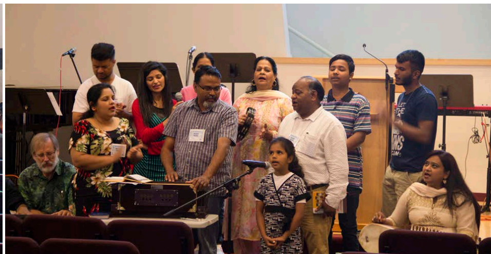
Special music is presented by choirs and groups at the Convention.